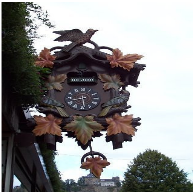
Biggest cuckoo clock in the World St. Goar, Germany

I think I marked the last 3 years with CAWCG and the year. (The earlier years were not marked.)